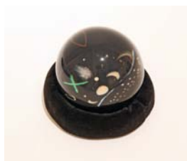
Viewing Ball , c. 1968 Cast Resin Sphere Diameter 3 " 7.6 cm (TO1421)