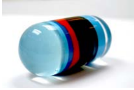
Untitled, 1968 Cast resin 3 x 1 1/4 " diameter 7.6 x 3.2 cm (TO1970)