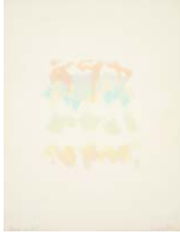
Untitled (Oregon Summer #1) , 1972 Aniline dye on paper 26 x 20 " 66 x 50.8 cm (TO2151)