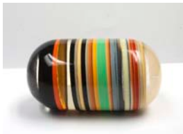
Untitled, 1968 Cast resin 2.5 long x 1.75 " diameter 6.4 x 4.4 cm (TO2285)