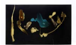
Untitled , circa 1974-1978 Cast resin with phosphorescent pigment 13.5 x 22 " 34.3 x 55.9 cm (TO2292)