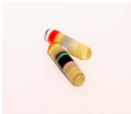
Runes, 1968 2 cast resin capsules 2 long x .5 " diameter (each) 5.1 x 1.3 cm (TO1422)