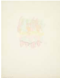
Untitled (Oregon Summer #5) , 1972 Aniline dye on paper 26 x 20 " 66 x 50.8 cm (TO2153)