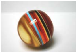
Untitled, 1968 Cast resin 1.5 " diameter 3.8 cm (TO2284)