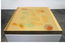
Untitled (Big Slab) , circa 1972 Cast resin 27.5 x 27.5 x 2.5 " 69.9 x 69.9 x 6.4 cm (TO2295)