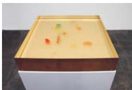
Untitled (Small Slab), circa 1972 Cast resin 12 x 12 x 2.5 " 30.5 x 30.5 x 6.4 cm (TO1426)