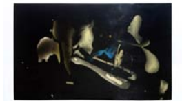
Untitled , circa 1974-1978 Cast resin with phosphorescent pigment 13.5 x 22 " 34.3 x 55.9 cm (TO2293)