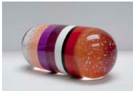
Untitled, 1968 Cast resin 1.5 diameter x 2.5 " 3.8 x 6.4 cm (TO2667)