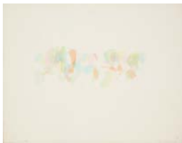
Untitled (Oregon Summer #3) , 1972 Aniline dye on paper 20 x 26 " 50.8 x 66 cm (TO2154)