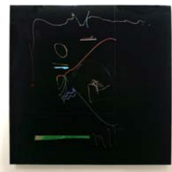
Untitled , circa 1974-1978 Cast resin with phosphorescent pigment 36 x 36 " 91.4 x 91.4 cm (TO2231)