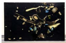
Untitled , circa 1974-1978 Cast resin with phosphorescent pigment 14 x 22 " 35.6 x 55.9 cm (TO1433)