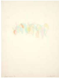
Untitled (Oregon Summer #10) , 1972 Aniline dye on paper 26 x 20 " 66 x 50.8 cm (TO2158)