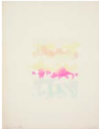
Untitled (Oregon Summer #20), 1972 Aniline dye on paper 26 x 20 " 66 x 50.8 cm (TO2163)