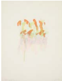
Untitled (Oregon Summer #4) , 1972 Aniline dye on paper 26 x 20 " 66 x 50.8 cm (TO2152)