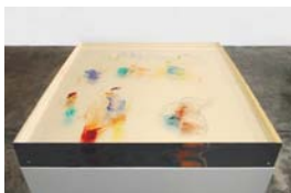
Untitled (Thick Slab), circa 1972 Cast resin 27 x 27 x 3.4 " 68.6 xcm 68.6 x 8.6 (TO2289)