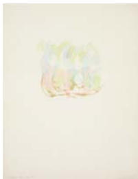
Untitled (Oregon Summer #7) , 1972 Aniline dye on paper 26 x 20 " 66 x 50.8 cm (TO2155)