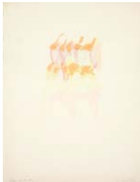
Untitled (Oregon Summer #11) , 1972 Aniline dye on paper 26 x 20 " 66 x 50.8 cm (TO2159)