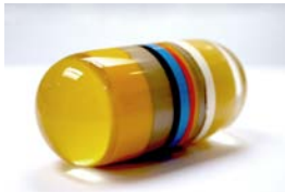
Untitled, 1968 Cast resin 3 x 1 1/4 " diameter 7.6 x 3.2 cm (TO1964)