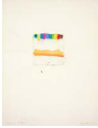
Untitled (Oregon Summer #8) , 1972 Aniline dye on paper 26 x 20 " 66 x 50.8 cm (TO2156)