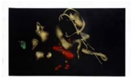
Untitled , circa 1974-1978 Cast resin with phosphorescent pigment 14 x 21 " 35.6 x 53.3 cm (TO2291)