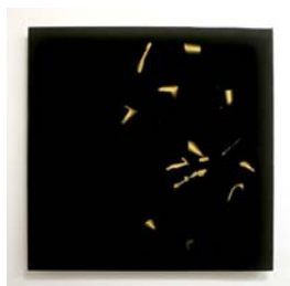
Untitled , circa 1974-1978 Cast resin with phosphorescent pigment 27.5 x 27.5 " 69.9 x 69.9 cm (TO2229)