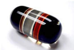
Untitled, 1968 Cast resin 3 x 1 1/4 " diameter 7.6 x 3.2 cm (TO1966)