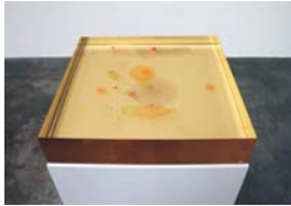
Untitled (Small Slab) , circa 1972 Cast resin 12 x 12 x 2.5 " 30.5 x 30.5 x 6.4 cm (TO2296)