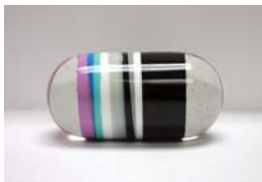
Untitled, 1968 Cast resin 1.5 diameter x 2.5 " 3.8 x 6.4 cm (TO2668)