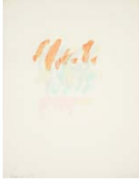
Untitled (Oregon Summer #17), 1972 Aniline dye on paper 26 x 20 " 66 x 50.8 cm (TO2161)