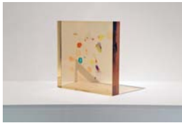
Untitled (Slab) , circa 1972 Cast resin 12 x 12 x 2.5 " 30.5 x 30.5 x 6.4 cm (TO2362)