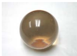
Untitled Cast resin 5 " diameter 12.7 cm (TO2669)