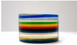
Untitled, 1968 Cast resin 1.6 x 2 " diameter 4.1 x 5.1 cm (TO1971)