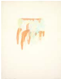
Untitled (Oregon Summer #12) , 1972 Aniline dye on paper 26 x 20 " 66 x 50.8 cm (TO2160)