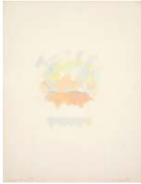
Untitled (Oregon Summer #9) , 1972 Aniline dye on paper 26 x 20 " 66 x 50.8 cm (TO2157)