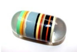
Untitled, 1968 Cast resin 3 x 1 1/4 " diameter 7.6 x 3.2 cm (TO1967)