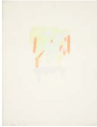
Untitled (Oregon Summer #18), 1972 Aniline dye on paper 26 x 20 " 66 x 50.8 cm (TO2162)